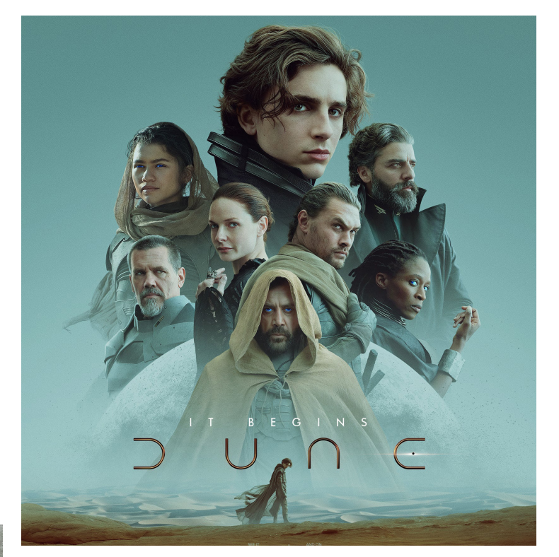
Suitable for those within Year Seven and above; Shang-Chi And The Legend Of The Ten Rings, 12 Mighty Orphans, Free Guy, Respect, No Time To Die, Venom Let There Be Carnage, Dune. The French Dispatch